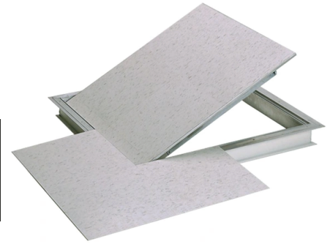
Single Leaf Door Shown