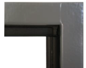
Gasketing: Heavy Duty EPDM Rubber

For detailed specifications see submittal sheet