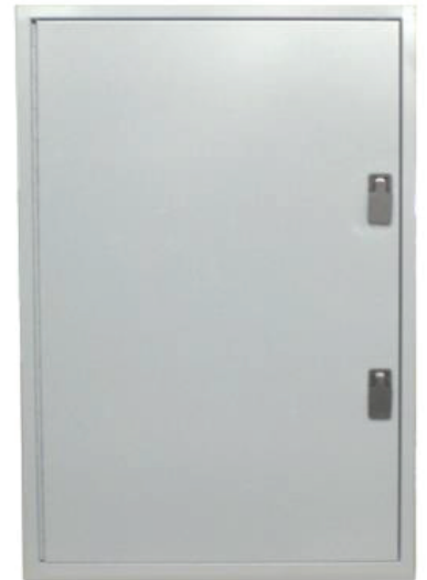
STC-2436F3G in Gray