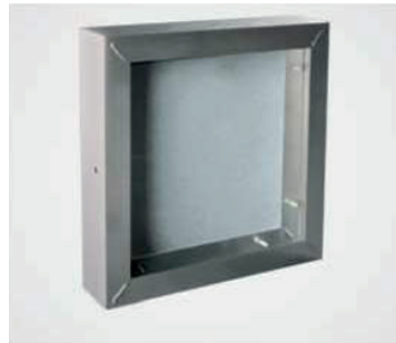
Side opening non-removable

All standard sizes are available in 1/2" (12.7 mm) or 5/8" (15.9 mm) drywall.