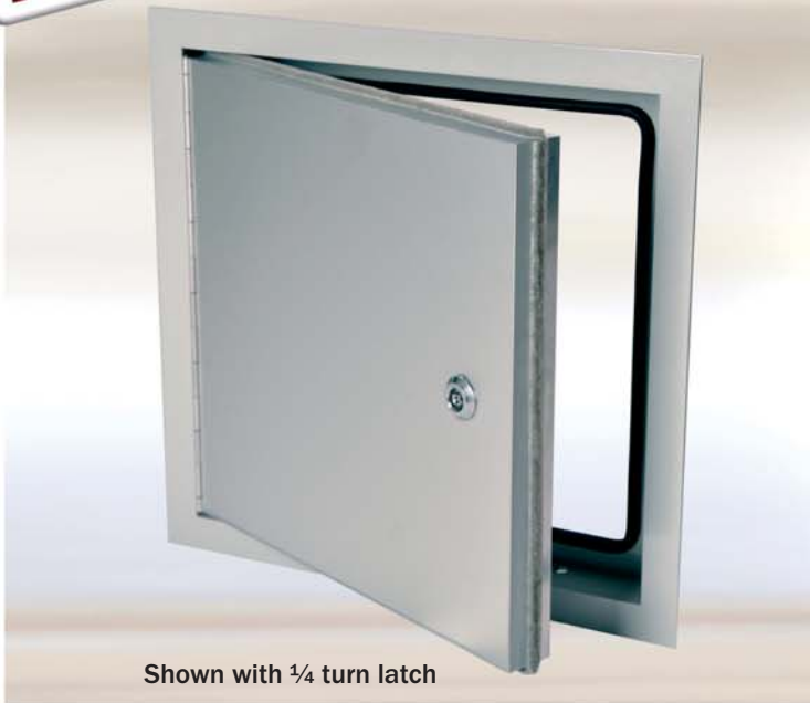
Shown with 1/4 turn latch